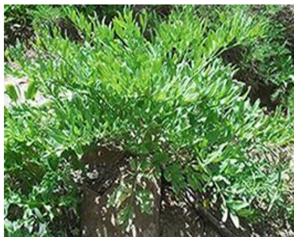
Fig 1. Dorema ammoniacum D. Don.

groups for example: nitrogen containing compounds including (amines, alkaloids and amides), terpenoids (monoterpenes, sesquiterpenes and diterpenes), hydrocarbons (aliphatic, aromatic and cyclic hydrocarbons) and the others of remaining groups were assigned in the next levels. The quantitative amounts of mentioned compounds in order of priorities were as follows: nitrogen containing compounds including amines (73.5 %), alkaloids (17.2 %) and amides (9.3 %), terpenoids consists of monoterpenes (82.88 %), sesquiterpenes (12.97 %) and diterpenes (4.14 %), hydrocarbons involving aliphatic hydrocarbons (88.66 %), aromatic hydrocarbons (7.5 %), cyclic hydrocarbons (3.83 %), alcohols (2.76 %), ketones (3.95 %) and miscellaneous compounds (2.22 %). The specifications of the entire identified constituents of the essential oils of Dorema ammoniacum D. Don. along with their retention time and also GC/MS chromatogram of it are shown in Table 1 and figure 2 (Table 1 and Fig 2).