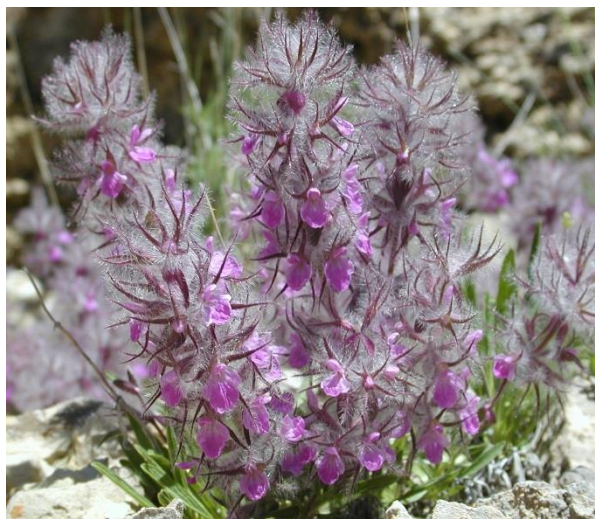
Fig 1. Stachys lavandulifolia Vahl.

The chemical compounds of each essential oil were identified by calculating their retention indices ( R_i ) under temperature programmed conditions for n -alkanes (C 9 -C 30 ) and the oil on DB-5 column under the same chromatographic conditions. Identification of individual compounds was made by comparison of their Mass spectra with those of the internal reference Mass spectra library or with authentic compounds and confirmed by comparison of their retention indices with authentic compounds in literature (Adams, 2001).